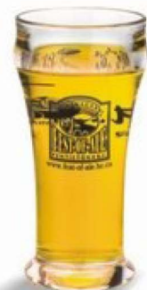
(sample w/silk screen printing)