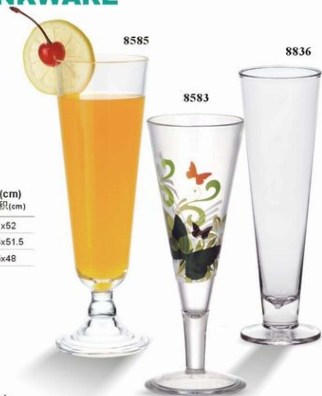
(sample w/water decal)